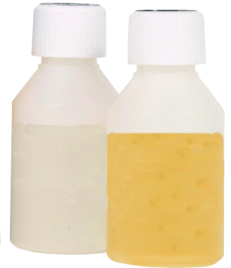
Epoxy Wood Stabiliser 225ml